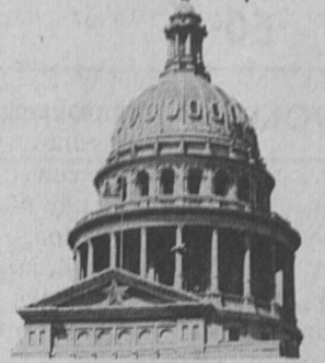
HIGHLIGHTS By Ed Sterling